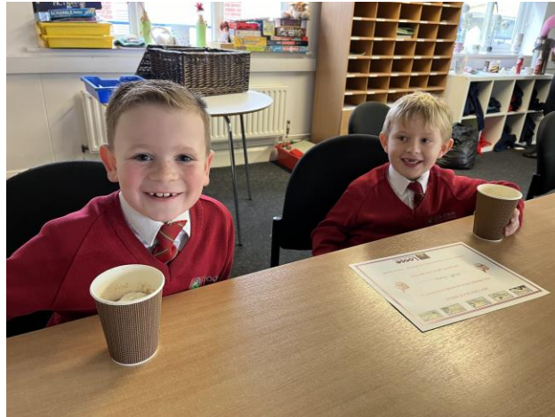
Hot Chocolate Friday 23rd February