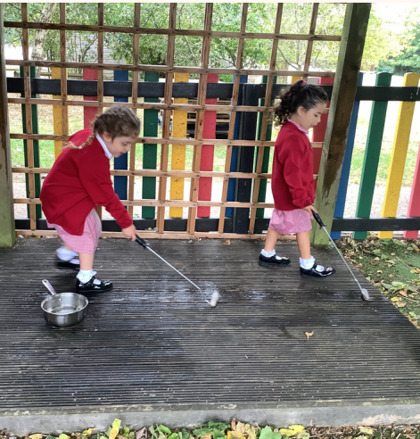
EARLY YEARS NEWS