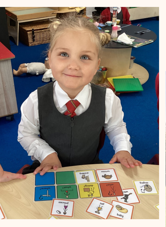
EARLY YEARS NEWS