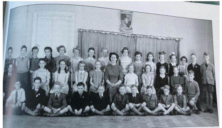
A 1950s class when the school motto was: Courtesy, Honesty, Loyalty