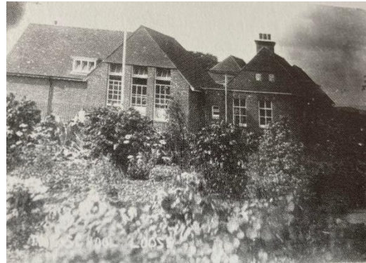
The "new" school building