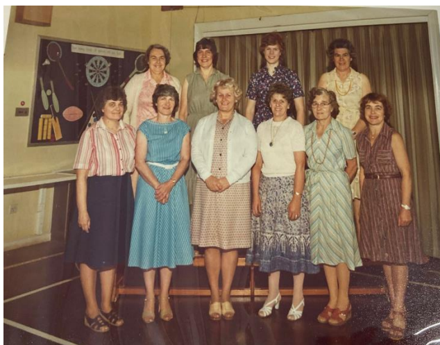
Loose staff in the late 1970s