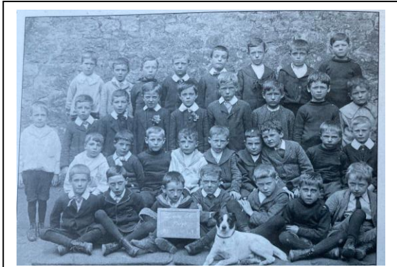
Last photo taken at old school site