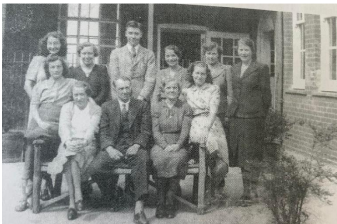
1940s staff in the Quad outside what is now Coral Classroom