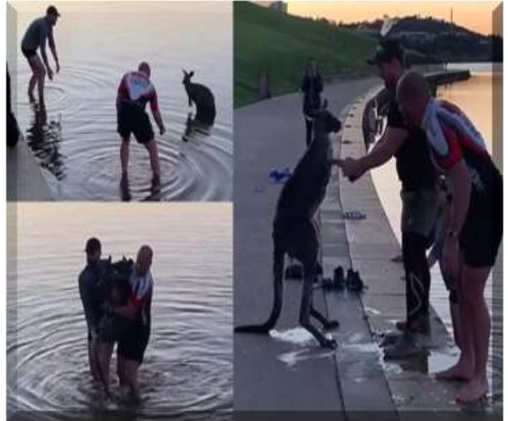
Pictured: The kangaroo rescue mission!

kangaroo in danger, frightened or injured, contact wildlife rescue authorities as they can become defensive and dangerous.