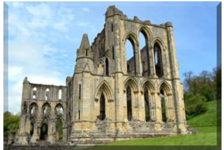
Pictured: One of the participating sites, Rievaulx Abbey, North Yorkshire.

and spirits of the busy, noisy, demanding distractions of contemporary life.’ For many of us, getting to an English Heritage Site might be tricky but, perhaps you could find time at home or school for your own hour of contemplation, if you want to.